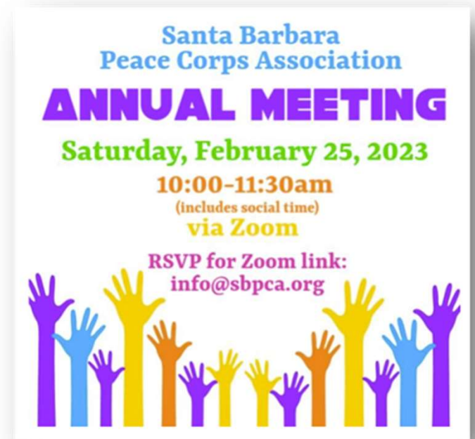
Annual Meeting TODAY! Online Event (via Zoom)