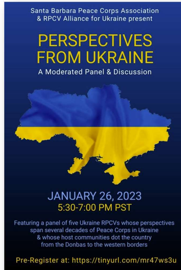
Perspectives from Ukraine: A Moderated Panel and Discussion THURSDAY, JANUARY 26, 2023 Online Event (via Zoom)