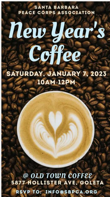
New Year's Coffee SATURDAY, JANUARY 7, 2023 @ Old Town Coffee, Goleta