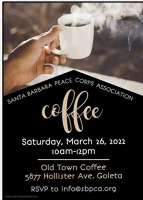
Coffee Get-together SATURDAY, MARCH 26, 2022 @ Old Town Coffee, Goleta