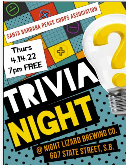
Trivia Night THURSDAY, APRIL 14, 2022 @ Night Lizard Brewing Co., Santa Barbara