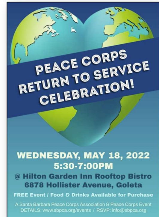
Peace Corps Return to Service Celebration! WEDNESDAY, MAY 18, 2022 @ Hilton Garden Inn Rooftop Bistro, Goleta